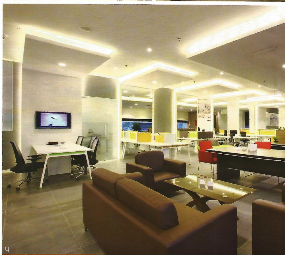
2. Cross section of the showroom showing the payment counter, 3. Another cross section of the showroom, 4. A display panel with LDC screen for presentation along with a discussion table for clients. Desk placed with sofas or discussion tables give it a real office feel.