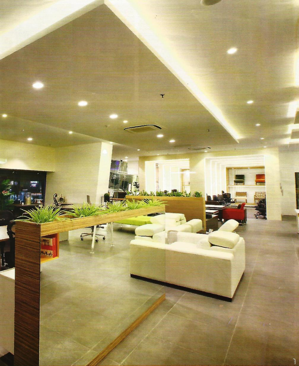
1. The vastness of the space on first floor is experienced through high ceiling and enhanced lighting.