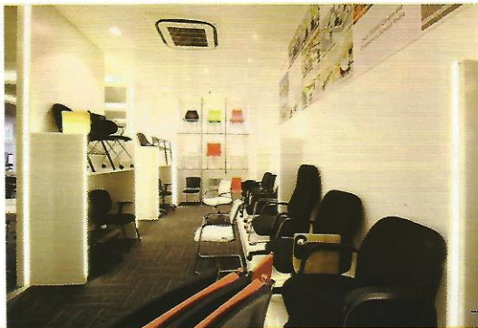
5. Cross section of the showroom showing arrangement of sofas and workstations. 6&7. Cross section of the showroom showing arrangement of sofas and workstations.